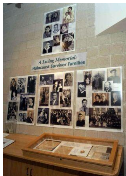
A Living Memorial