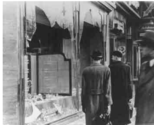
Shattered storefront of a Jewish business