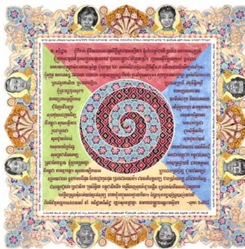
Cambodian Illuminated Manuscript

For more information about these illuminations, visit the artist’s Web site at www.20thcenturyilluminations.com/beygen.html .